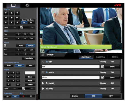
Camera controls and overlay customisation screen with browser on PC